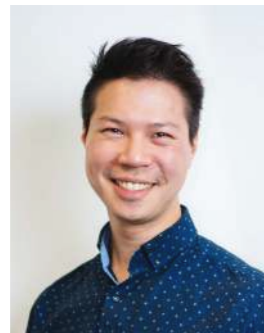
Francis Voon Equality Campaign